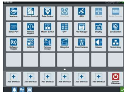
Easy to use settings page, always easily within reach