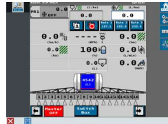
ISOBUS Universal terminal screen with integrated Task Controller