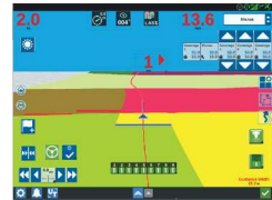
Guidance screen with customizable layout