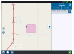
Start-up screen with map based navigation